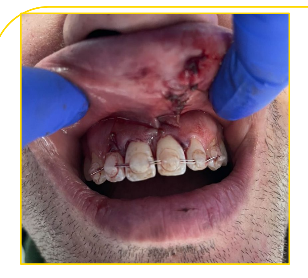
Figure 1 - image of patient post spilinting and gingival repair

"Traumatic dental injuries (TDIs) occur frequently in children and young adults, comprising 5% of all injuries. Twenty-five percent of all school children experience dental trauma and 33% of adults have experienced trauma to the permanent dentition, with the majority of the injuries occurring before age 19. Luxation injuries are the most common TDIs in the primary dentition, whereas crown fractures are more commonly reported for the permanent teeth. Proper diagnosis, treatment planning and follow-up are important to assure a favorable outcome" (1) This case study presents a treatment case of full avulsion of teeth #8 and #9 following the International Association of Dental Traumatology, Dental Trauma Guidelines.