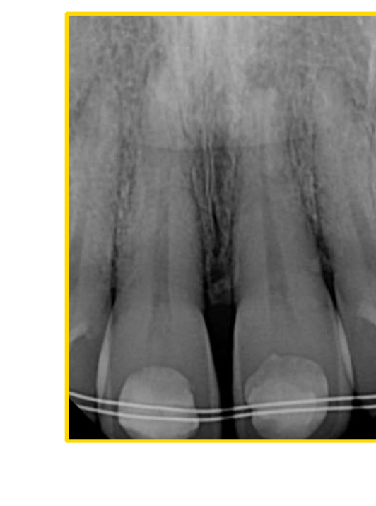
Figure 3: two week follow up

Figure 4: pulpectomy initiated at 2nd week